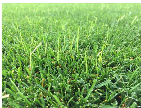
Etiolated tiller syndrome symptoms of bluegrass/ryegrass soccer field in central PA during July of 2018 (Photos by Pete Landschoot).

On the positive side, we have not observed disease activity associated with dry soils this summer, such as rust or Type-I fairy ring symptoms. However, we have a few more weeks of warm weather ahead, and it seems that anything is possible this year.