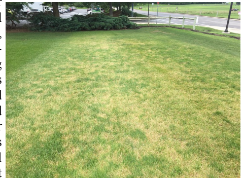
Kentucky bluegrass lawn showing extensive dollar spot damage in late July of 2018 (Photo by Pete Landschoot).

Throughout July and August, dollar spot, brown patch, and Pythium blight damaged turf in just about every region of Pennsylvania. Kentucky bluegrass lawns were particularly hard hit with dollar spot in the central part of the state, and some may require reseeding this fall. Bentgrass fairways, tees, and greens suffered considerable dollar spot infestations as well. Even tall fescue, the most dollar spot-tolerant cool-season turfgrass species, showed softball-sized spots and foliar lesions in lawns during periods of high humidity.