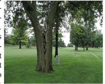
Co-dominant leaders are two or more stems emerging from the same area of a tree's trunk, an occurrence that commonly results in compressed bark and trunk tissue, severe cracks, and the eventual development of heartwood decay.

Trees can provide significant functional and aesthetic value on a golf course. The shade, structure and beauty they lend are an essential factor in the overall enjoyment of golfers and visitors alike. Keeping trees healthy requires following best management practices for vigor, and integrated pest management techniques for pest control. When things don't go according to plan, however, most situations will call for malady diagnosis, otherwise referred to as "triage."