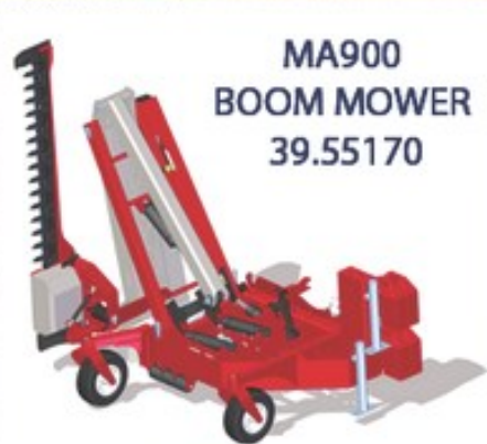
MA900 BOOM MOWER 39.55170