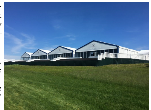
Corporate tents lined several of the fairways at Shinnecock Hills.

The U.S. Open trophy outside the clubhouse at Shinnecock Hills, which will again host the U.S. Open in 2026.