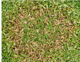
Symptoms of Microdochium patch on a putting green, and close up of individual patch on P. annua .

Leaf spot is a disease of bentgrass greens and fairways. It often shows up as circular or irregular reddish-brown patches of varying sizes during periods of persistent, light rain in May and June. Spots on individual leaves have red or reddish-brown borders, and can be observed with a good-quality hand lens or dissecting microscope. As the disease progresses, spots coalesce and develop into blighting of entire leaves and stems. Although the cigar-shaped spores of the pathogen(s), Bipolaris or Dreschlera spp. , are easy to identify using a microscope in a diagnostic lab, they are too small to be observed in the field. Many different fungicides can be used to control leaf spot diseases, including those containing iprodione, chlorothalonil, and the strobilurins.