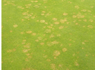
Symptoms of Microdochium patch on a putting green, and close up of individual patch on P. annua .

azoxystrobin and azoxystrobin combination products (Headway, Strobe T, and others); Concert II (chlorothalonil + propiconazole); Instrata (chlorothalonil + propiconazole + fludioxonil); Fame+T (fluoxastrobin + tebuconazole); Interface (iprodione + trifloxystrobin); and others.