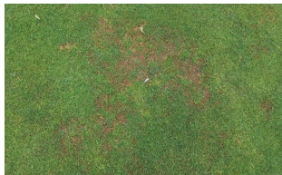
Leaf spot symptoms on bentgrass fairway in central PA.

Leaf spot is a disease of bentgrass greens and fairways. It often shows up as circular or irregular reddish-brown patches of varying sizes during periods of persistent, light rain in May and June. Spots on individual leaves have red or reddish-brown borders, and can be observed with a good-quality hand lens or dissecting microscope. As the disease progresses, spots coalesce and develop into blighting of entire leaves and stems. Although the cigar-shaped spores of the pathogen(s), Bipolaris or Dreschlera spp. , are easy to identify using a microscope in a diagnostic lab, they are too small to be observed in the field. Many different fungicides can be used to control leaf spot diseases, including those containing iprodione, chlorothalonil, and the strobilurins.