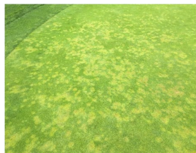
This disease of P. annua on a putting green in western PA was diagnosed as summer patch.

During early June, several golf courses in the Pittsburgh area experienced damage on P. annua putting greens and fairways from one or more root and crown diseases. Root/crown diseases are difficult to diagnose because fungal pathogen structures used for identification are not easily observed in root tissue, more than one fungus may be present in the roots, and some fungi on or in roots revert to pathogenic activities only when plants are under environmental or cultural stress. Despite these issues, disease outbreaks were diagnosed as a Pythium root disease and/or summer patch. The fact that root diseases are occurring this early in the season reflects the unusual weather conditions experienced in May and early June. In the case of root/crown diseases, fungicides are most effective when applied prior to symptom expression. Disease symptoms may continue to develop when fungicides are applied after the disease becomes apparent.