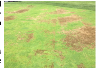
Mower injury on bentgrass putting green.

Mowing is always a challenge when turf is wet and soils are saturated, but when coupled with rapid late-spring growth, the result can be scalping injury on putting greens. One of the worst cases I observed was on a course where the membership requested the superintendent curtail his spring aeration and top-dressing practices. Towards the end of May, the bentgrass became puffy and was severely scalped when mowed under wet conditions.