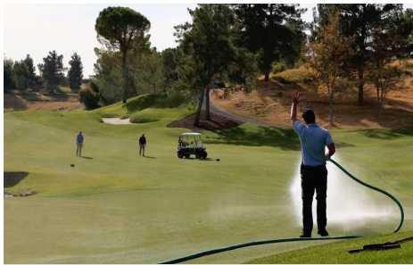
Golfers can help superintendents protect the putting greens during hot weather by being patient with maintenance practices that help turf survive heat stress.

One adjustment superintendents make to protect the putting greens during hot weather is raising the mowing height. Mowing at low heights is a common practice to achieve fast green speeds. Unfortunately, low mowing heights also leave very little leaf area available for photosynthesis. During periods of hot weather, turfgrass that is mown extremely low will struggle to produce enough energy and can quickly decline.