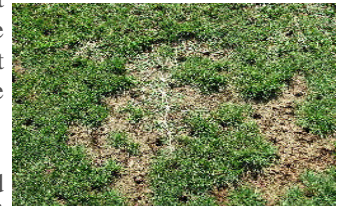
During the heat of the summer, bermudagrass populations will expand into areas of weak turf or bare ground. Control of bermudagrass in cool-season fairways is extremely challenging.

The first real cold front of the fall season swept through the area in the past week, bringing in much cooler temperatures. This is welcome relief for the grass in what has been a long, and for much of the time, hot growing season. Fall offers the opportunity for some of the best golf course conditions of the season.